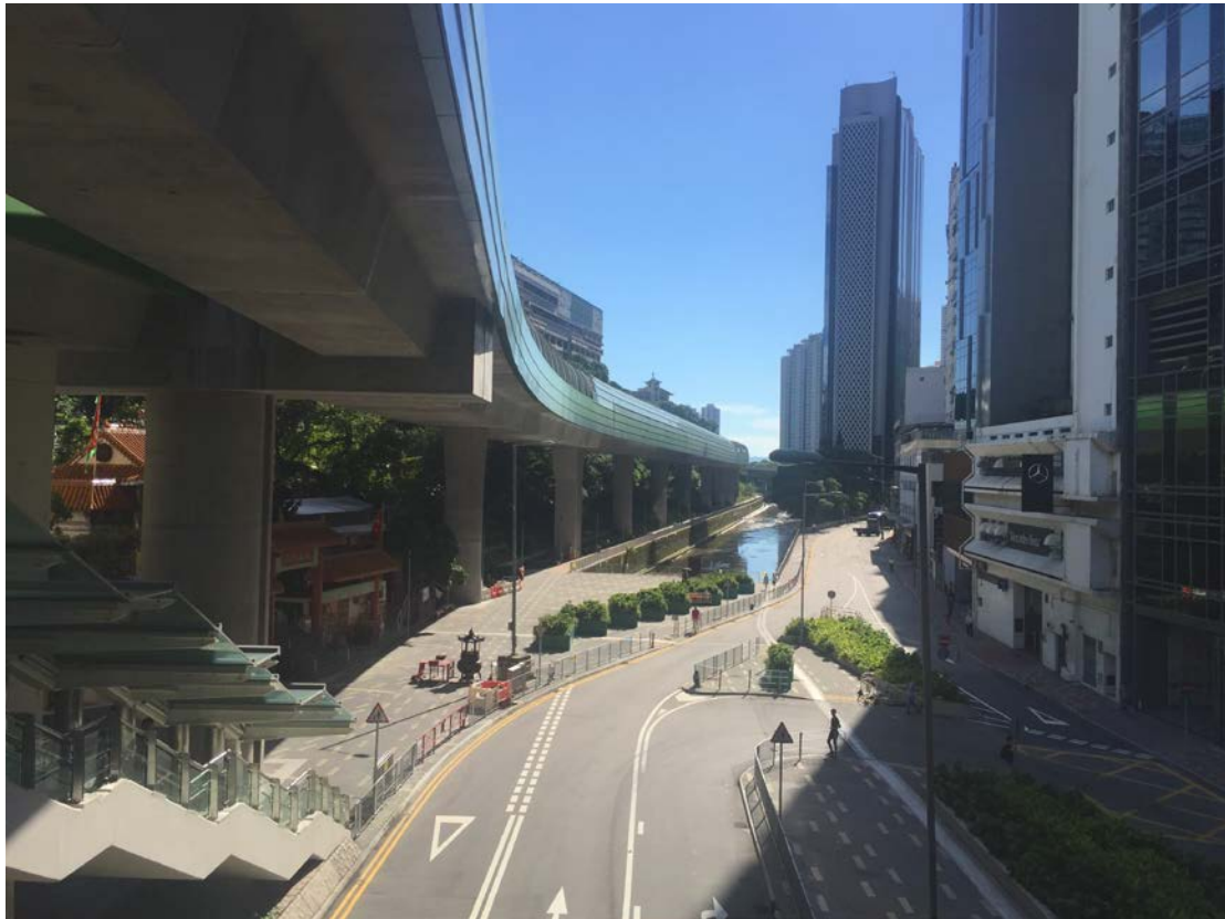
Aberdeen after opening of the MTR South Island Line (Photo 2017)